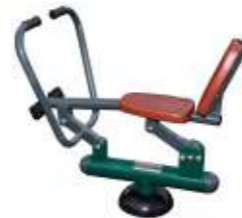
GYM309 Children's Rower