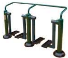
GYM306 Children's Double Health Walker