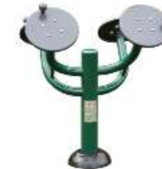
GYM311 Children's Tai Chi Discs