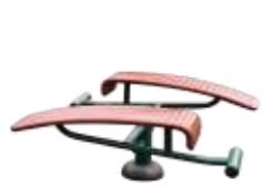
GYM301 Children's Double Sit Up Bench