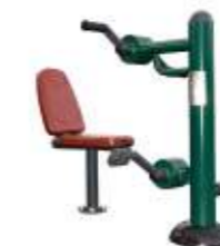
GYM312 Children's Arm and Pedal Bike