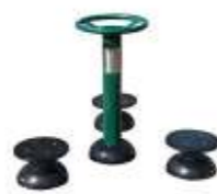
GYM303 Children's Waist Trainer