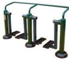
GYM306 Children's Double Health Walker