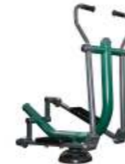
GYM310 Children's Sky Stepper