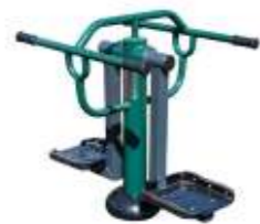
GYM307 Children's Double Slalom Skier