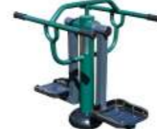
GYM307 Children's Double Slalom Skier