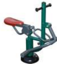
GYM308 Children's Horse Rider