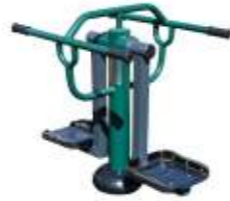
GYM307 Children's Double Slalom Skier