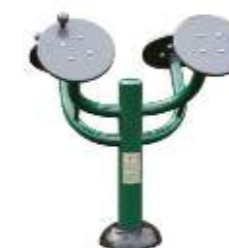
GYM311 Children's Tai Chi Discs