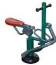
GYM308 Children's Horse Rider