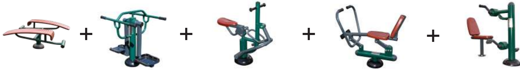
GYM301 Children's Double Sit Up Bench