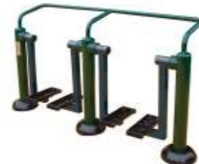
GYM306 Children's Double Health Walker