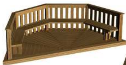
4m HALF - WITHOUT ROOF