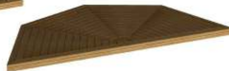
4m HALF - STAGE ONLY