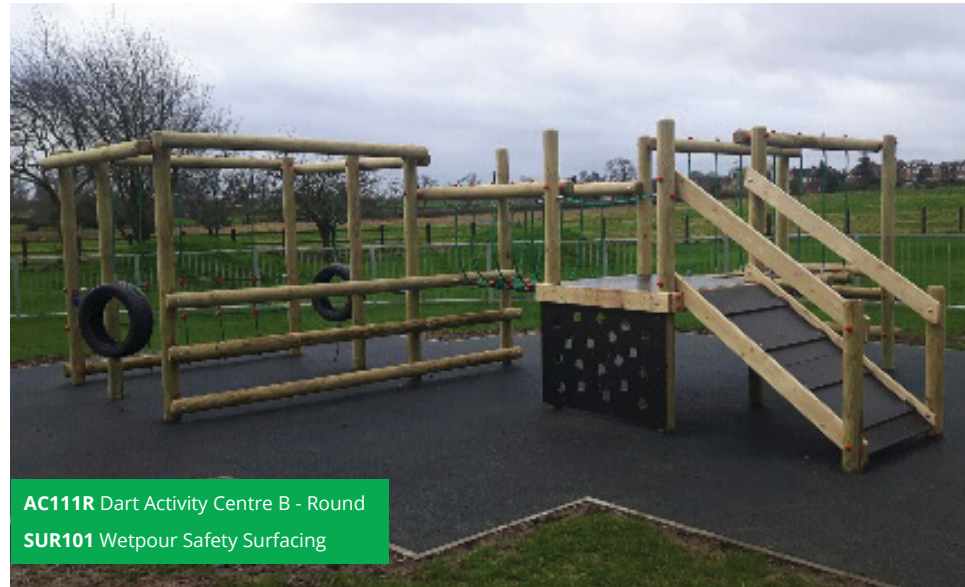
AC111R Dart Activity Centre B - Round SUR101 Wetpour Safety Surfacing

Uttoxeter Rural Parish Council are extremely happy with their new play equipment and have provided their local community with a new great play area.