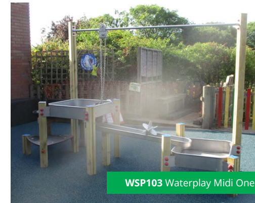
WSP103 Waterplay Midi One