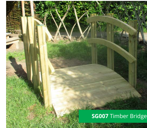
SG007 Timber Bridge