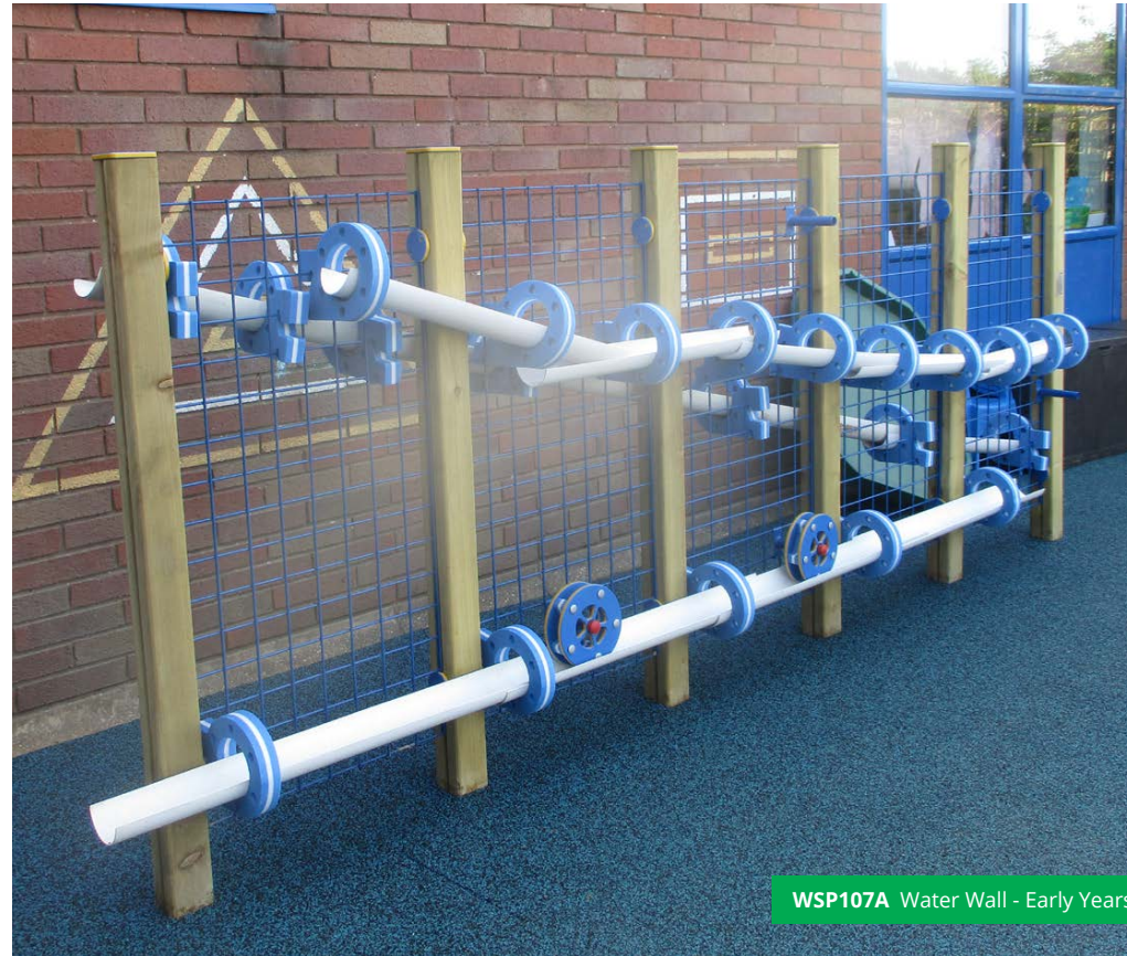
WSP107A Water Wall - Early Years

To allow all weather play, we installed blue and black fleck Wetpour Safety Surfacing which added a great touch of colour and really finished off the area. A great project overall to have been a part of!