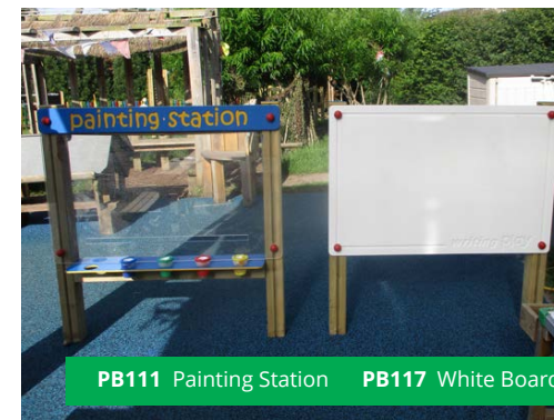
PB111 Painting Station PB117 White Board