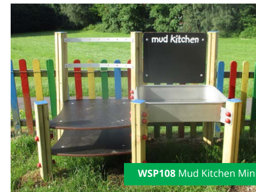
WSP108 Mud Kitchen Mini