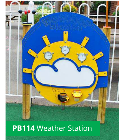
PB114 Weather Station