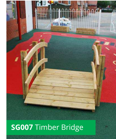
SG007 Timber Bridge